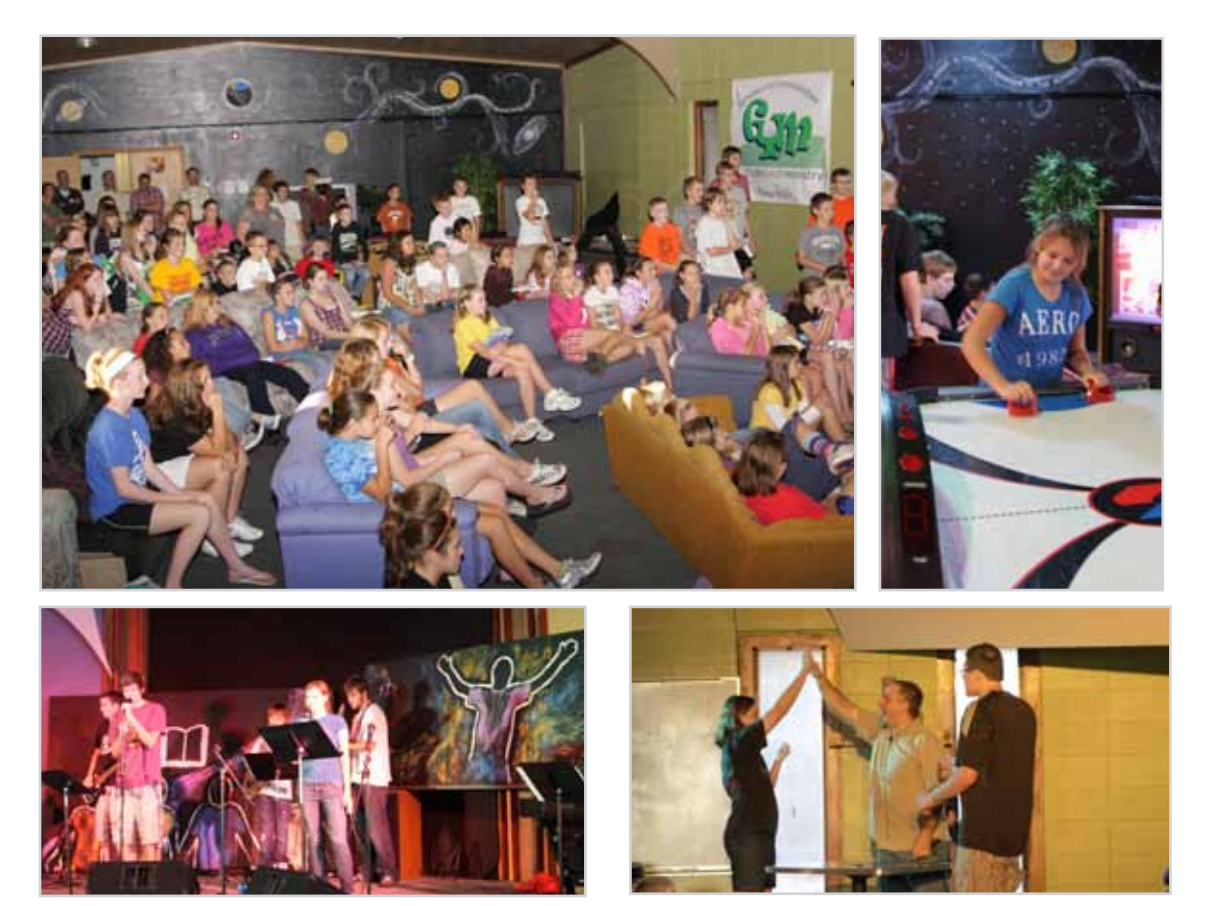
Last Wednesday, we had more than a hundred youth gather for opening worship, teaching, fellowship, games and small groups.